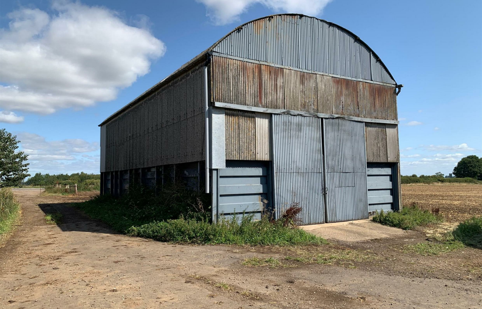
Lings Barn, Main Road, Croxton Kerrial, NG32 1QF

Storage Barn 7 miles from the A1 at Grantham